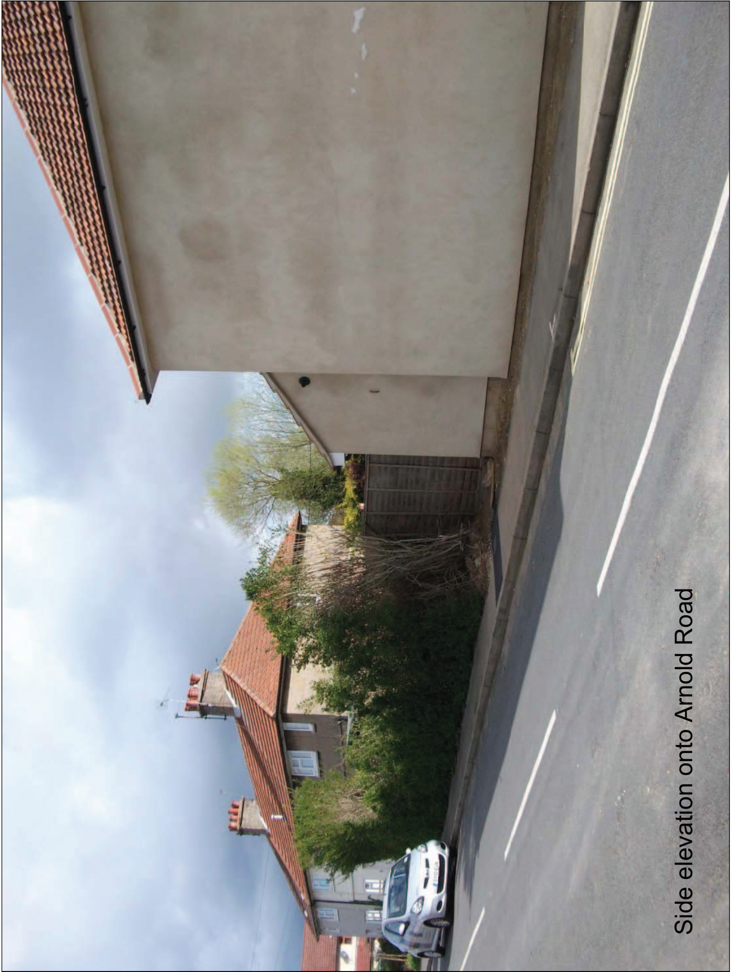
Side elevation onto Arnold Road