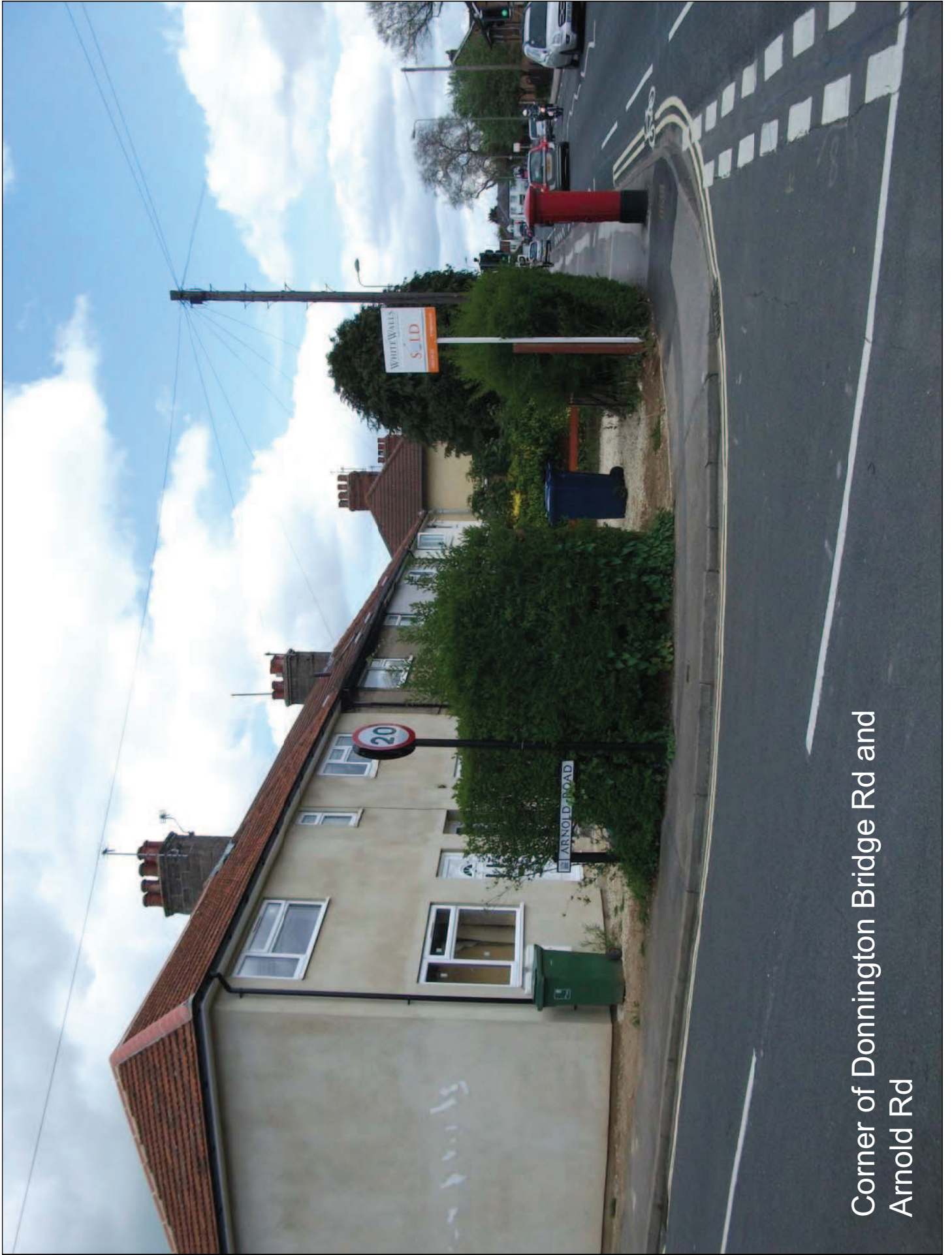
Corner of Donnington Bridge Rd and Arnold Rd